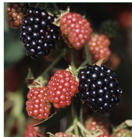
Figure 7. Blackberry fruit.