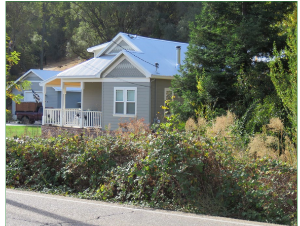
Figure 1. Blackberries growing along a roadway and encroaching into the home landscape.

Both Himalayan and cutleaf blackberry are evergreen and have 5-angled stems. Himalayan blackberry is easily distinguishable from the other blackberries by its robust thorns and 5 distinct