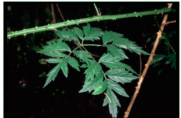
Figure 2. Cutleaf blackberry, Rubus laciniatus .