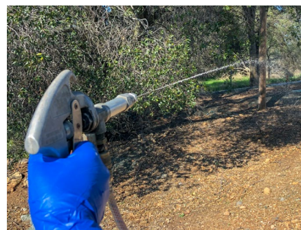
Figure 10. Spray gun used to make a drizzle foliar application.

Triclopyr is available over-the-counter in either amine or ester formulations. Triclopyr ester is more effective on blackberries, since this formulation is more easily absorbed into the foliage and stems. Products containing a minimum of 61% active ingredient of the ester formulation can provide good to excellent control when applied at 1 to 1.2 ounces of product per gallon of water (0.75%–1% of the total solution). One such product with this concentration is Brushtox Brush Killer with Triclopyr. Other less concentrated formulations, such as Crossbow, are also available for licensed professionals.