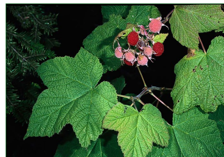
Figure 4. Thimbleberry, R. parviflorus .

The two primary methods for managing blackberries are mechanical removal and treatment with herbicides. Blackberries can regenerate from the crown or rhizomes following mowing, hand pulling, tillage, burning, or herbicide treatment. This makes them difficult to control and management measures often require follow-up treatment.