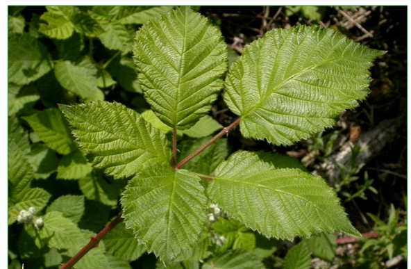
Figure 3. Himalayan blackberry, R. armeniacus .