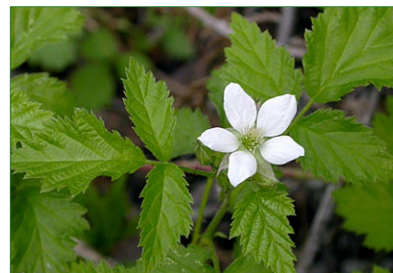
Figure 5. California blackberry, R. ursinus .