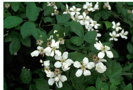
Figure 6. Blackberry flowers.